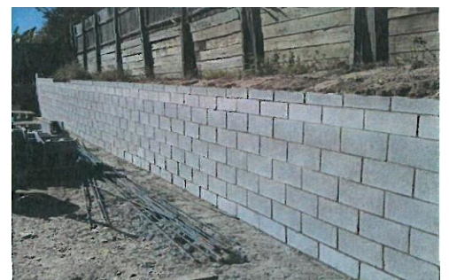
Smooth Face CMU Wall