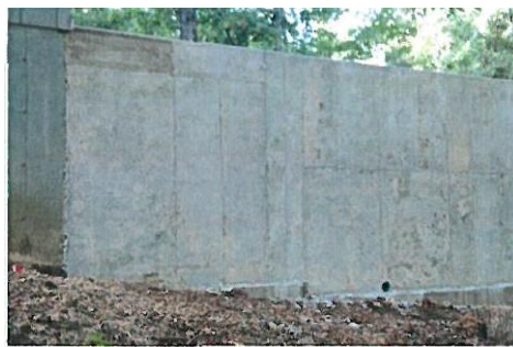
Smooth Concrete Wall