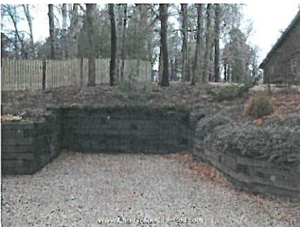
Railroad Tie/ Wood Wall