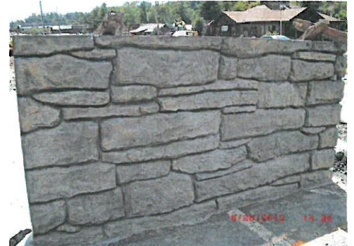
Concrete Form Liner Wall